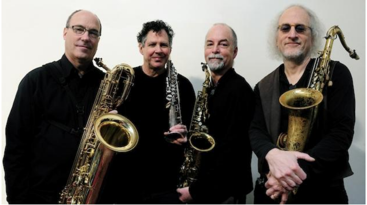
Rova Saxophone Quartet

No work better captures Rova's borderless sensibility than Adams's The Dark Forest Suite , a distilled, six-movement piece inspired by the all-male Basiani Choir from the Republic of Georgia. Adams borrowed the title from a series of toasts at a vodka-powered after-party during Rova's 1989 tour of the Soviet Union, when a Georgian poet repeatedly declared "Let's all go into the dark forest!" By steadily commissioning new works by composers outside the group, Rova's sylvan odyssey has taken on unprecedented proportions.